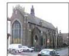
St Ambrose & St Leonard's