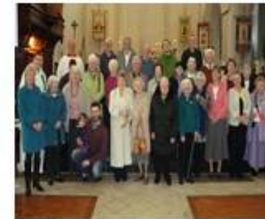
St. Aidan's Church

God's people to live as a Christian presence in the world