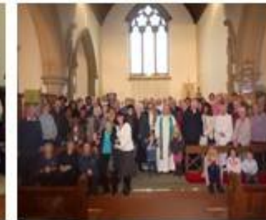
St John's Church