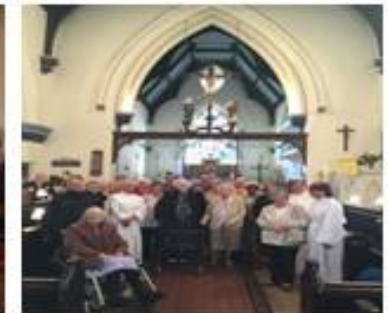
St Michael's Church